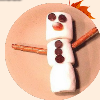
Snowman Party Treat