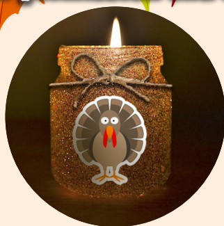
Thanksgiving Votive Candleholder