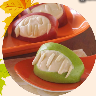
Ghostly Goblin Grins

Use your math and science skills for Fall fun. Be sure and ask your parents for permission and assistance.